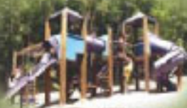
MECHON PLAYGROUND, PHASE 8

PHASE 10 PASO ESPERANZA MARIA LUISA ESTATE PARK BANGALOD, CEBU