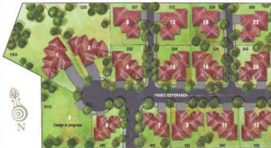
SITE DEVELOPMENT PLAN HOUSE NUMBER AND LOT SIZE (sq m)

Enjoy a lifestyle designed for a privileged few. This is the address in Cebu City. Limited private residences are available. This is an exclusive offering and we take pleasure to invite you to participate in this ownership opportunity.